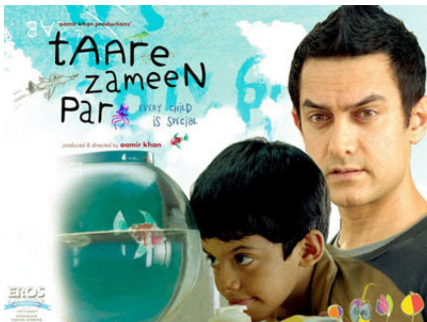
Taare Zameen Par Tamil Dubbed